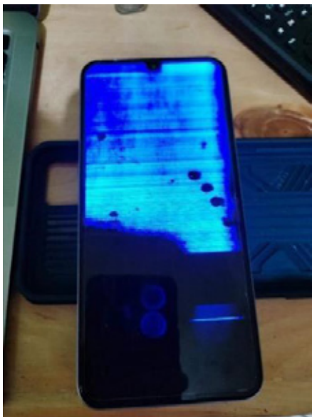
Figure 1. 2 informant gadgets that suffered screen damage

When the informant bought the cellphone at Shopee at the same time with a gadget protection insurance product provided by Shopee from PasarPolis, with policy number APP-414715631 and a period of 12 months. So the product should be able to be tracked until September 4, 2023. On January 8, 2023, the informant's mobile phone was put in his bag. When he got home, and was about to use his mobile phone, it turned out that the phone screen was already in a cracked striped state and no longer had a picture. It can't be used at all.